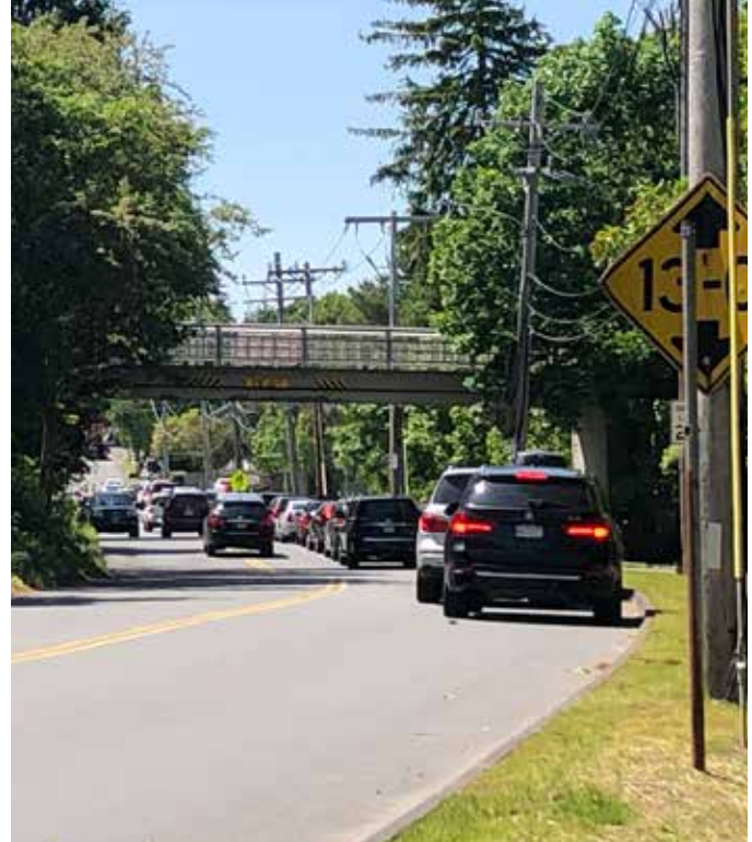
Drivers on Lincoln Street cross the median line to pass a pile up caused by pick up at the middle/high school.

Children wishing to cross Lincoln Street north of the school can use the pedestrian bridge or the crosswalk outside Manchester Essex Regional Middle/High School. This crosswalk is well-painted and has a curbside crossing sign but presents challenges to pedestrians during pick-up and drop-off hours. Through traffic often try to cut around cars queueing up to drop off or pick up by driving on the opposite side of the road. As we watched middle/high school dismissal, a second lane of westbound traffic formed to pass those waiting to get to the middle/high school. Pedestrians using the crosswalk are difficult to see through the line of cars, leaving them vulnerable to