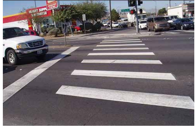
Crosswalk and stop line