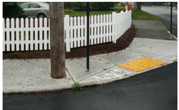
Curb ramp and detectable warning strip

Curb ramps provide access from the sidewalk to the street for people using wheel chairs and strollers. They are most commonly found at intersections. While curb ramps have improved access for wheelchair-bound people, they are problematic for visually impaired people who use the curb as an indication of the side of the street. Detectable warning strips, a distinctive surface pattern of domes detectable by cane or underfoot, are now used to alert people with vision impairments of their approach to streets and hazardous drop-offs.