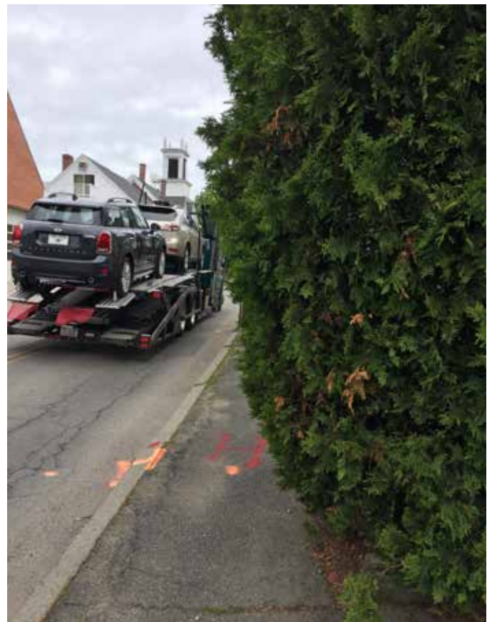
Overgrown hedges paired with narrow sidewalks are a consistent problem for walkers.