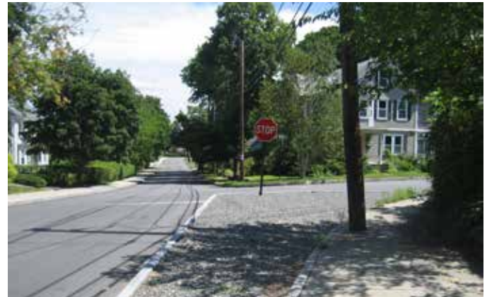
(A) Gravel-filled curb extension

There are two excellent examples of the shortening of curb radii in Woburn, MA. The first (A) is a low-cost solution using a gravel-filled zone between the original curb line and the newly established road edge. The second is a higher-cost solution using grass and trees and extending the sidewalks to the new curb. Both work to slow traffic.