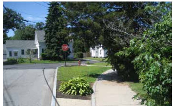
(B) Grass, trees and extended sidewalk in curb extension