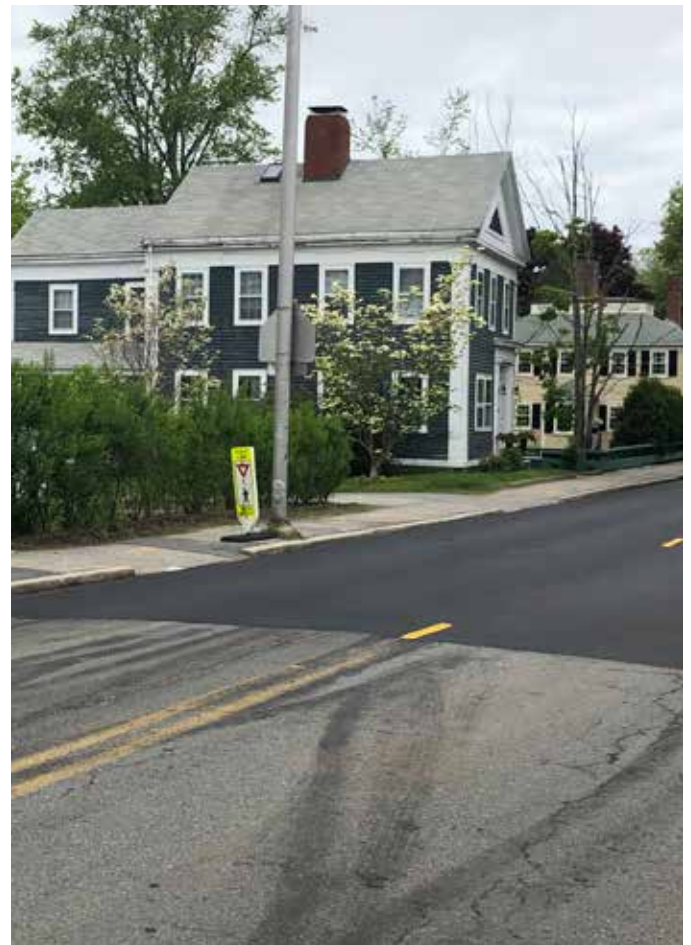
On School Street, a car is parked on the sidewalk and an in-street pedestrian sign is moved off the roadway.