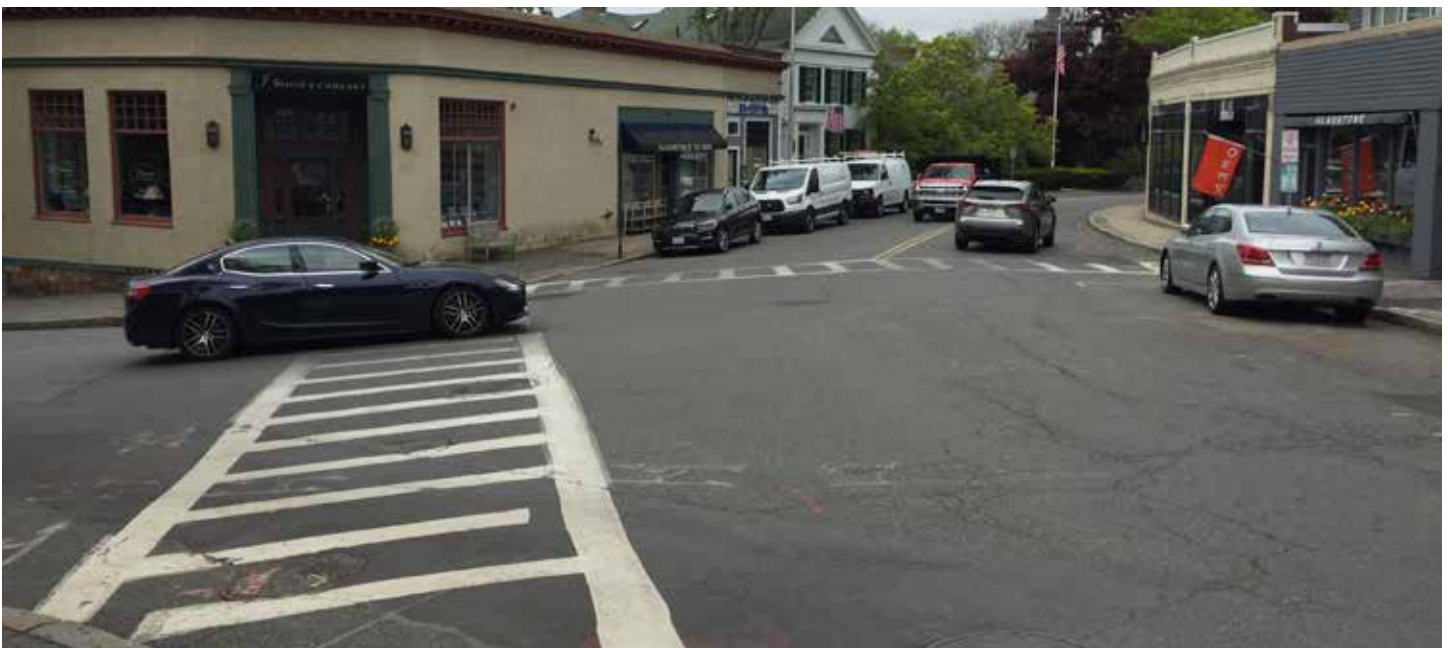
At the intersection of Union Street and Beach Street, cars are typically parked up to the intersection. The Town's Complete Streets proposal for this intersection seeks to make crossing safer for pedestrians.