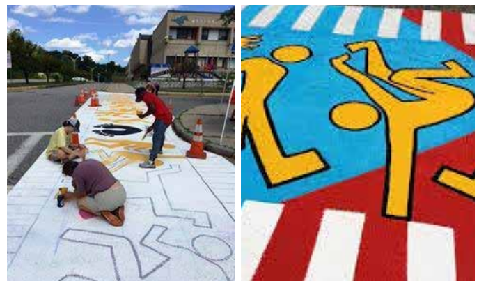
Students paint a unique crosswalk outside Medford High School.

Children wishing to cross Lincoln Street north of the school can use the pedestrian bridge or the crosswalk outside Manchester Essex Regional Middle/High School. This crosswalk is well-painted and has a curbside crossing sign but presents challenges to pedestrians during pick-up and drop-off hours. Through traffic often try to cut around cars queueing up to drop off or pick up by driving on the opposite side of the road. As we watched middle/high school dismissal, a second lane of westbound traffic formed to pass those waiting to get to the middle/high school. Pedestrians using the crosswalk are difficult to see through the line of cars, leaving them vulnerable to