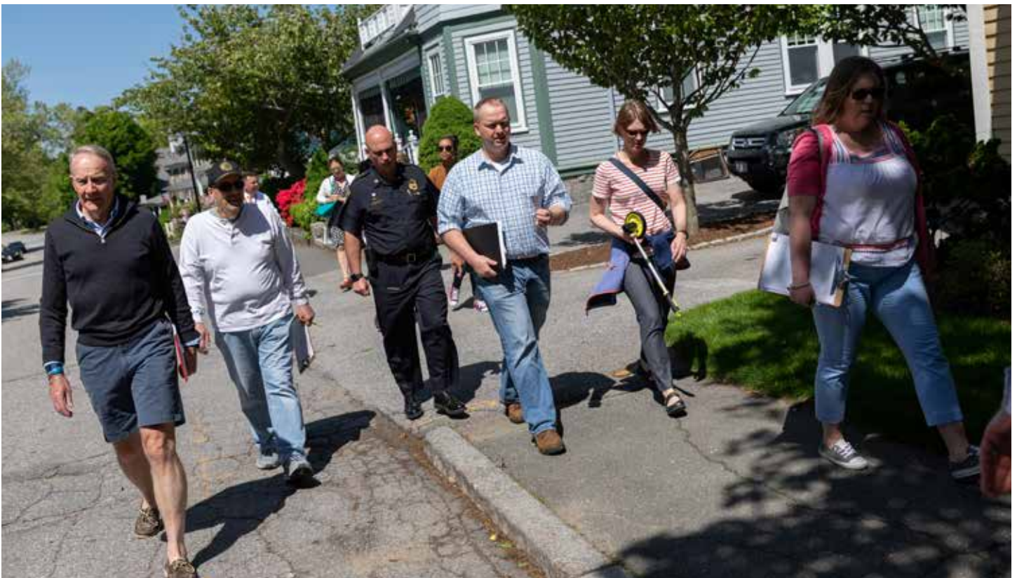
Walk audit participants walked from the elementary school to the village to identify potential barriers for pedestrians.

According to US Census data, 20.6% of Manchester residents are children. Children walk to and around their schools in groups, so narrow sidewalks and low visibility crosswalks are a particularly pressing problem here. Furthermore, renovations to the Manchester Memorial Elementary School in the upcoming year will mean that children must use new routes to get to their campus.