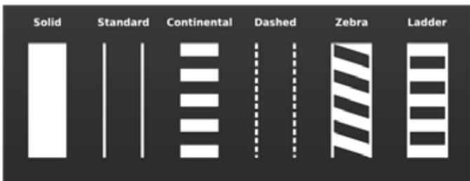
Crosswalk patterns

Crosswalks can be painted in a variety of ways, some of which are more effective in warning drivers of pedestrians. Crosswalks are usually accompanied with stop lines. These lines act as the legally mandated stopping point for vehicles, and discourage drivers from stopping in the middle of the crosswalk.