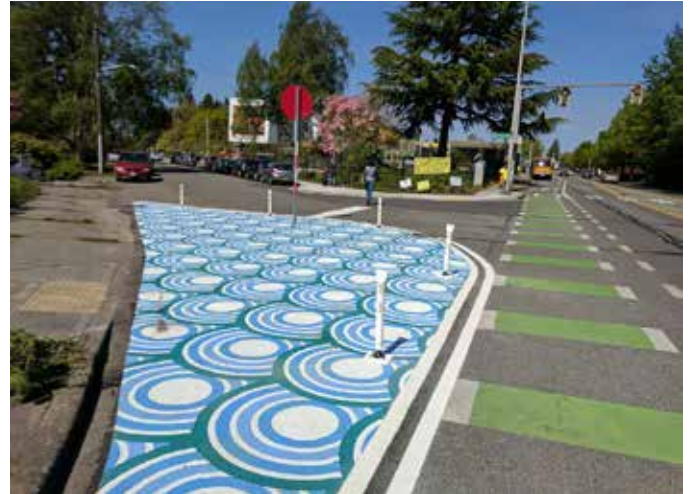
An eye-catching curb bulb painted near a school in Seattle.