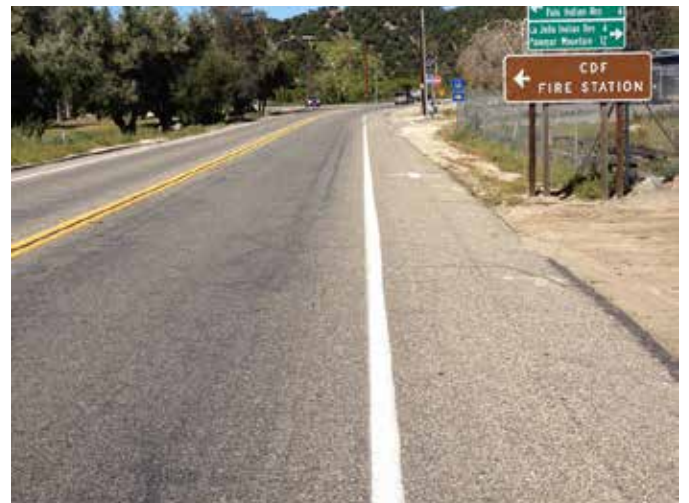
Fog lines delineate the vehicular driving zone on wide roadways.

A fog line is a solid white line painted along the roadside curb that defines the travel lane. It narrows a driver's perspective and helps to slow traffic speeds. Fog lines are used in urban, suburban and rural locations.