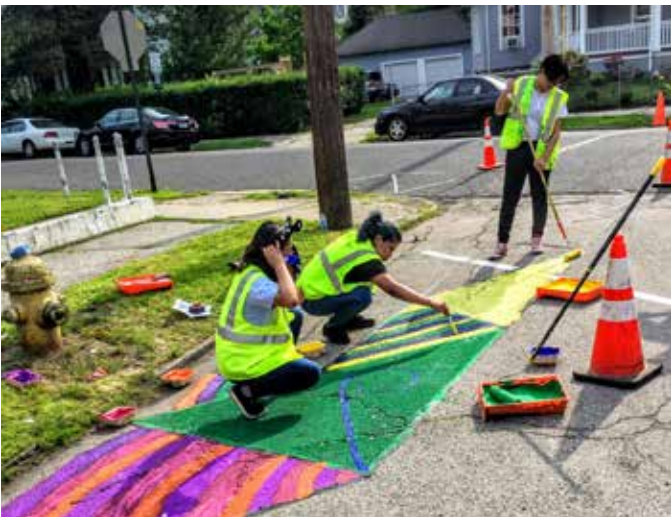
Youth in Bridgeport, CT paint colorful curb bulbs to slow drivers along walking routes to school.