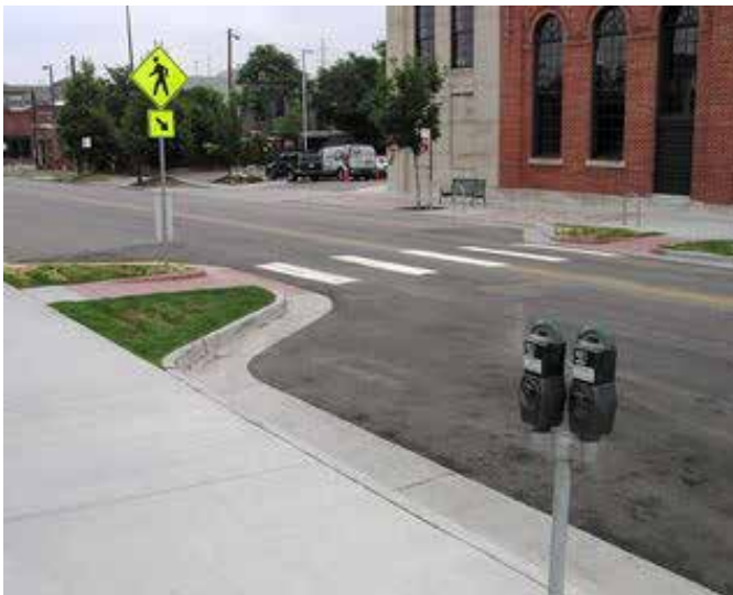
Curb extensions are often associated with mid-block crossings

A sidewalk extension into the street (into the parking lane) shortens crossing distance, increases visibility for walkers and encourages eye contact between drivers and walkers.