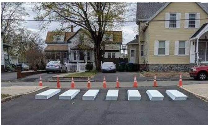
A 3D-appearing crosswalk in Medford is designed to slow drivers' speeds.

For children walking to school in Manchester-by-the-Sea, crossing the street to get to school can be precarious. Recent enhancements to the crosswalk at the school driveway south of the tennis courts include a Rectangular Rapid Flashing Beacon (RRFB), in-street pedestrian crossing sign, and a painted median. These enhancements provide more warnings to drivers that students are crossing at this location, but high traffic volumes and distracted drivers force everyone crossing here to remain vigilant.