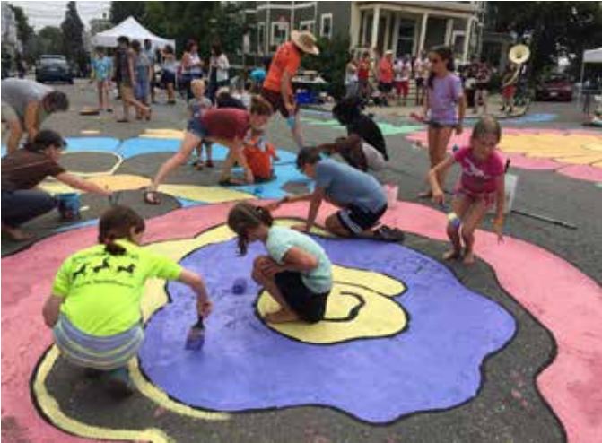
Community members in Somerville paint the Dimick Street intersection.