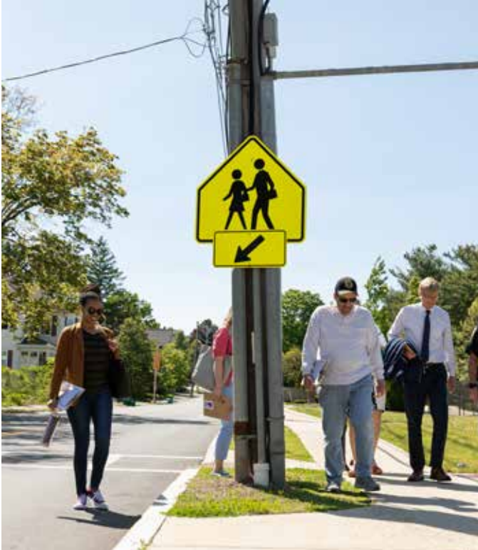
The crosswalk outside the middle/high school is well-marked but still poses visibility challenges during pick up and drop off times.