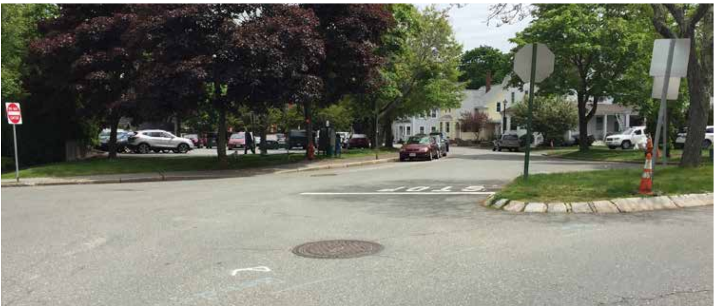
The wide 4-way intersection where Norwood Avenue, Washington Street, Union Street, and North Street come together is one of Manchester's proposed Complete Streets projects (See 'B').

In the short term, residents and town officials expressed interest in projects that used tactical urbanism. To this end, there are several examples from